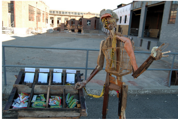
Knockdown Center Flea Market