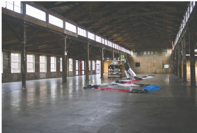
Inside the Knockdown Center