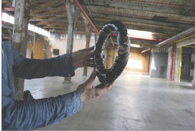
A prototype

“It’s totally big enough for someone to crawl inside there,” the guy said, proposing he could adapt it to be a series of rings instead of a solid tube, or adding bigger holes to make the tube more porous.