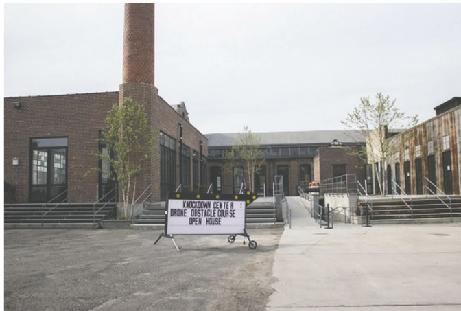
The Knockdown Center is accepting submissions for a drone obstacle course to be built this summer

Call me a hyper-sensitive freak, but when I first heard the buzzing sound of a drone hovering above the smooth concrete floor at Knockdown Center , I got the chills. There's something deeply ominous about drones, not least of all because they've become synonymous with a futuristic, one-sided (for now anyway) kind of warfare that's shrouded in secrecy. Somewhat evil undeniably, but drones are also fascinating. "I have a drone newsfeed and stuff pops up like every day, probably 10 or 15 different stories ranging from 'Three People Killed in Pakistan' to 'Drone Captures Surfing Dolphin' or 'Perverts are Spying on People,'" said Michael Merck, the creative director at Knockdown Center. It's no wonder, then, that the Queens-based art center has chosen drones as the centerpiece of its summer exhibition.